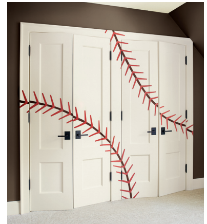
Walls and Arcs: Charred 440-7DB Ceiling, Doors and Trim: White Linen 007W Stitching: Red Rainboot 205-6DB

Tip: Depending on the arc color and the stencil color, a second coat of paint may be needed for added coverage.